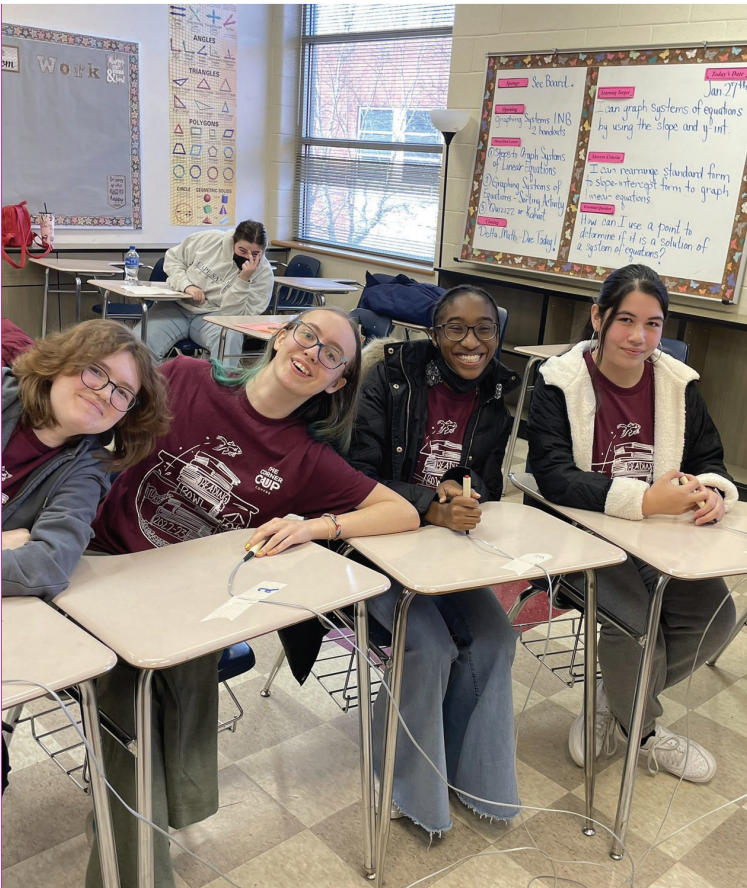
Members of the Tucker High Reading Bowl team.

• Tucker High School's Reading Bowl team tied with Lakeside High as first-place winners of the DeKalb County School District's Helen Ruffin Reading Bowl Competition. During the contest they showed off their knowledge of this year's Georgia Peach Teen Book Award Nominees.