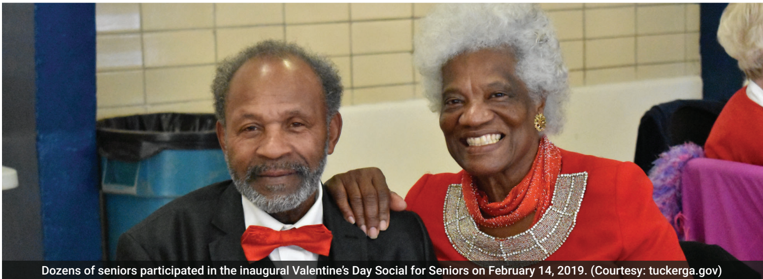
Dozens of seniors participated in the inaugural Valentine’s Day Social for Seniors on February 14, 2019.