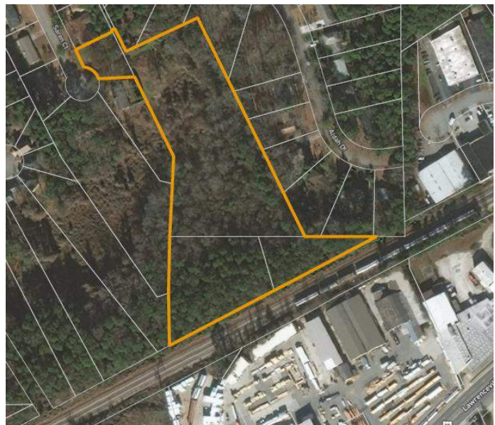
Zoning and Aerial Exhibits showing surrounding land uses.