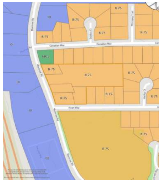
Zoning and Aerial Exhibits showing surrounding land uses.