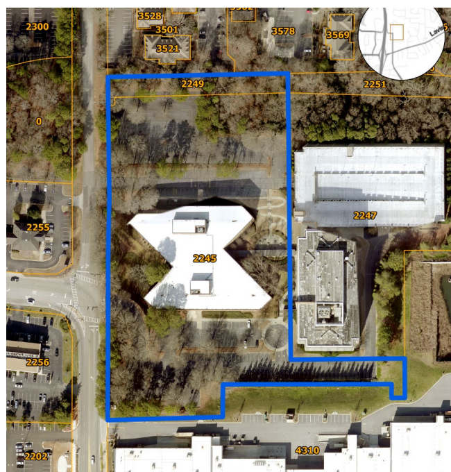
Aerial Exhibit showing surrounding land uses.