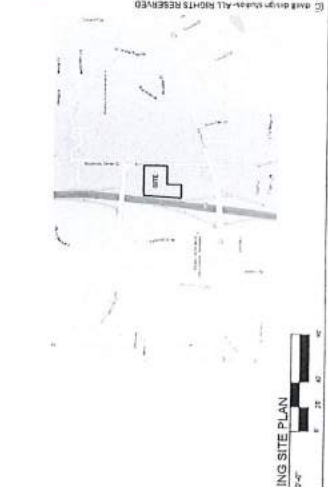
1 ZONING SITE PLAN