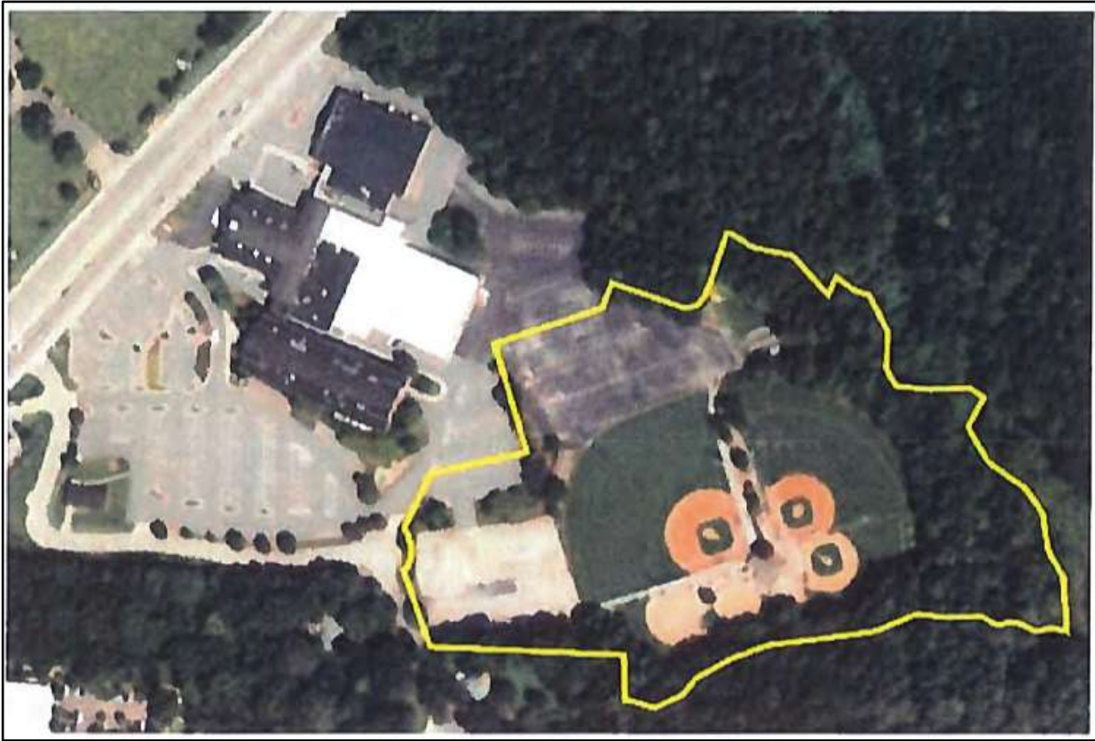
Figure 3: Boundary of proposed area for rezoning.

The proposed land use amendments are only for the rear of the property, as described in the legal description and illustrated in the image below. The total property at 2997 Lawrenceville Highway is \pm 24.20 acres, however, only \pm 12.2 acres are a part of these land use requests.