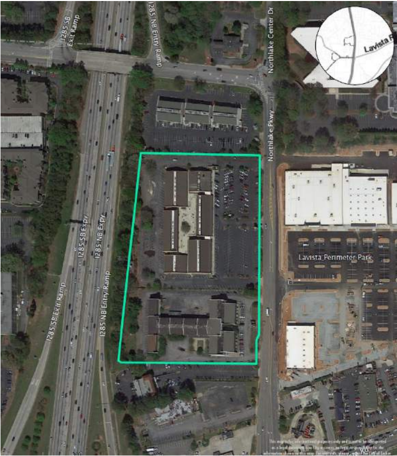
Aerial Exhibit showing surrounding land uses.