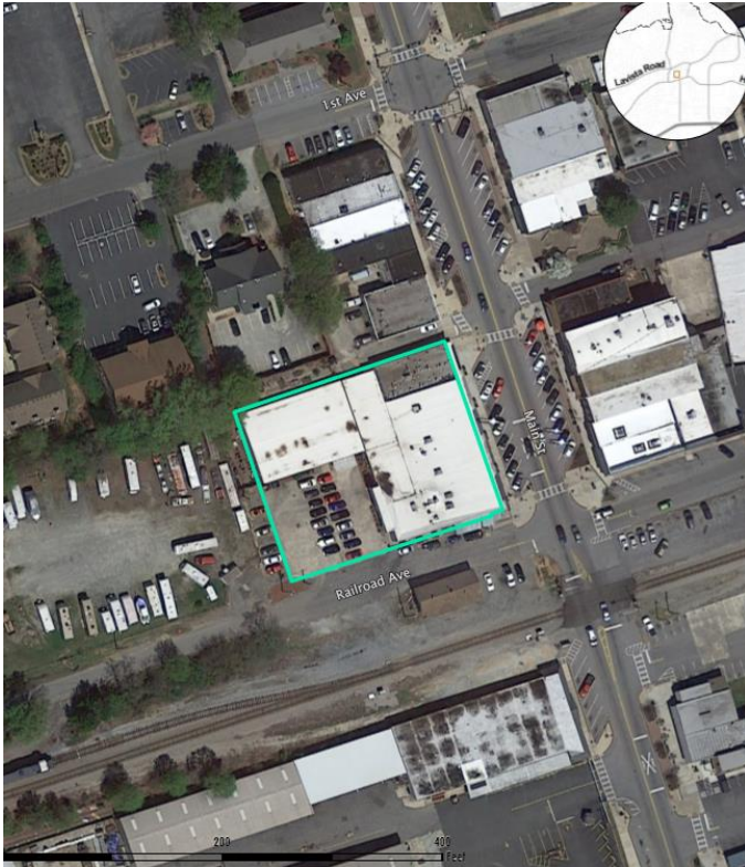
Aerial Exhibit showing surrounding land uses.