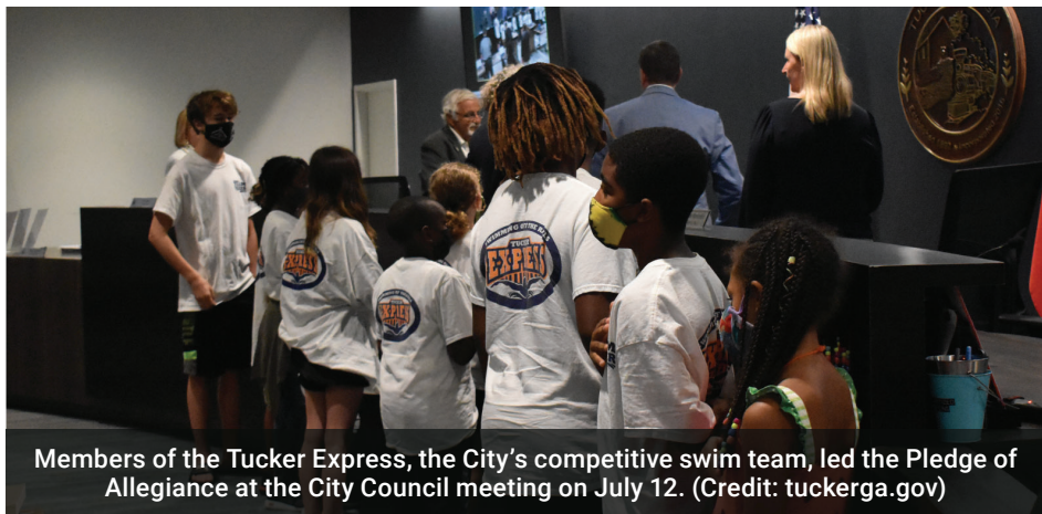
Members of the Tucker Express, the City's competitive swim team, led the Pledge of Allegiance at the City Council meeting on July 12.