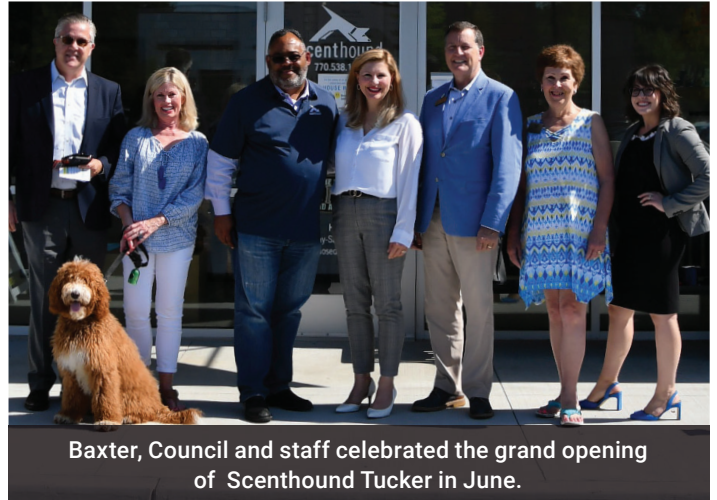
Baxter, Council and staff celebrated the grand opening of Scenthound Tucker in June.

a unique approach to grooming focusing on five core areas of routine and preventive care: Skin, Coat, Ears, Nails, and Teeth (SCENT) as in Scenthound.