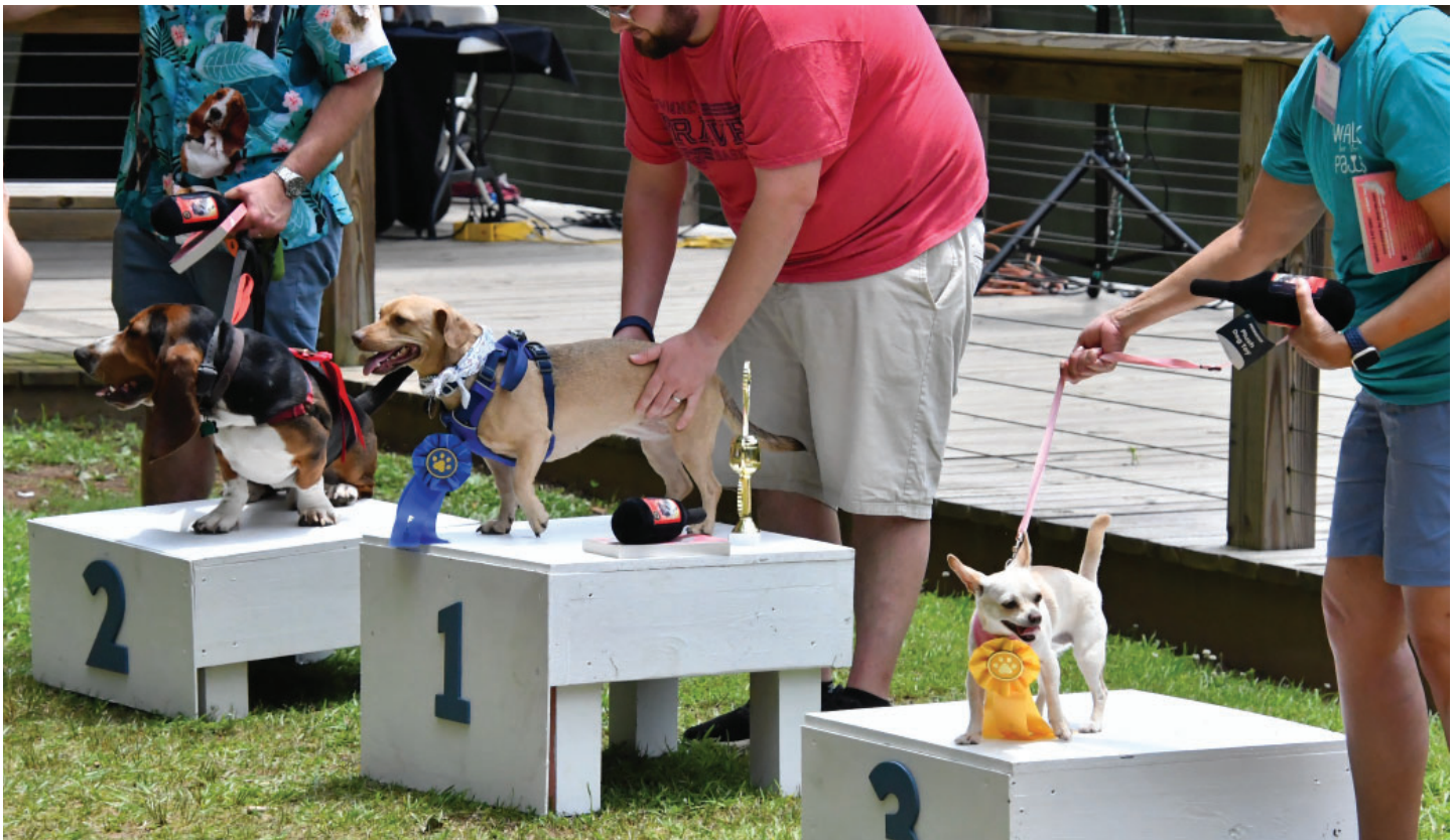
Bottom, left to right: Main Street in bloom, pitching at the GRPA State Baseball Tournament at Kelley Cofer Park, the winners of the Extraordinary Ears competition at Walk for the PAWS