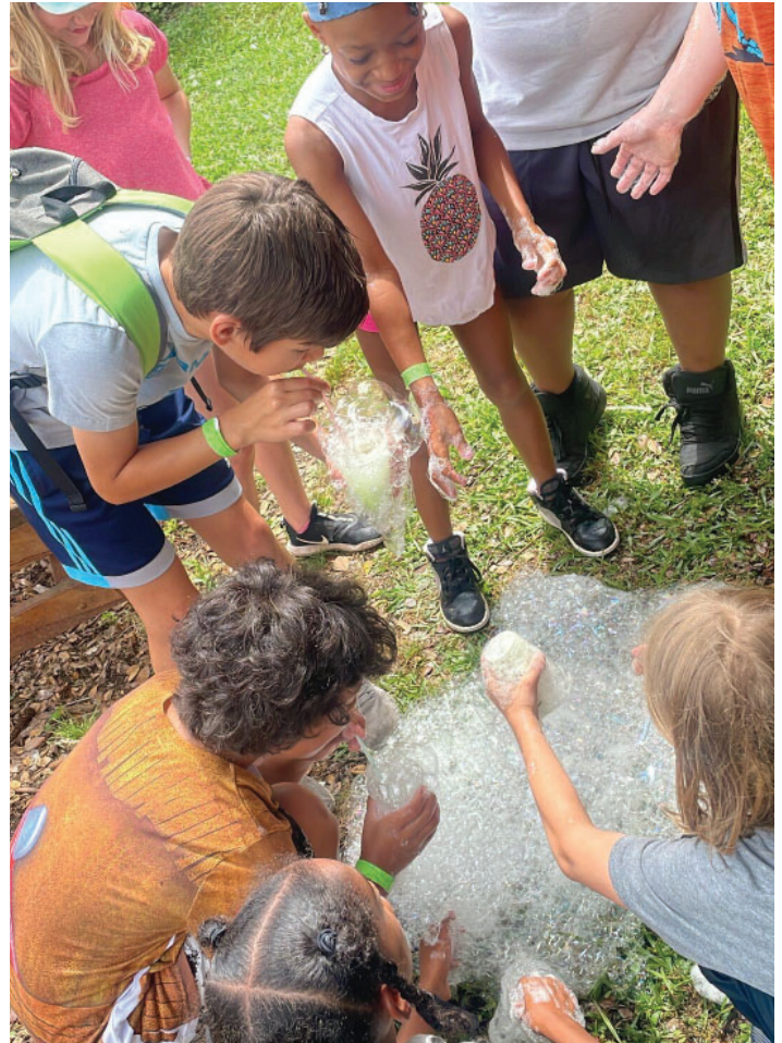
Top, left to right: Dancing at the Juneteenth Jubilee, the Tucker Express baseball team, summer campers performing a science experiment