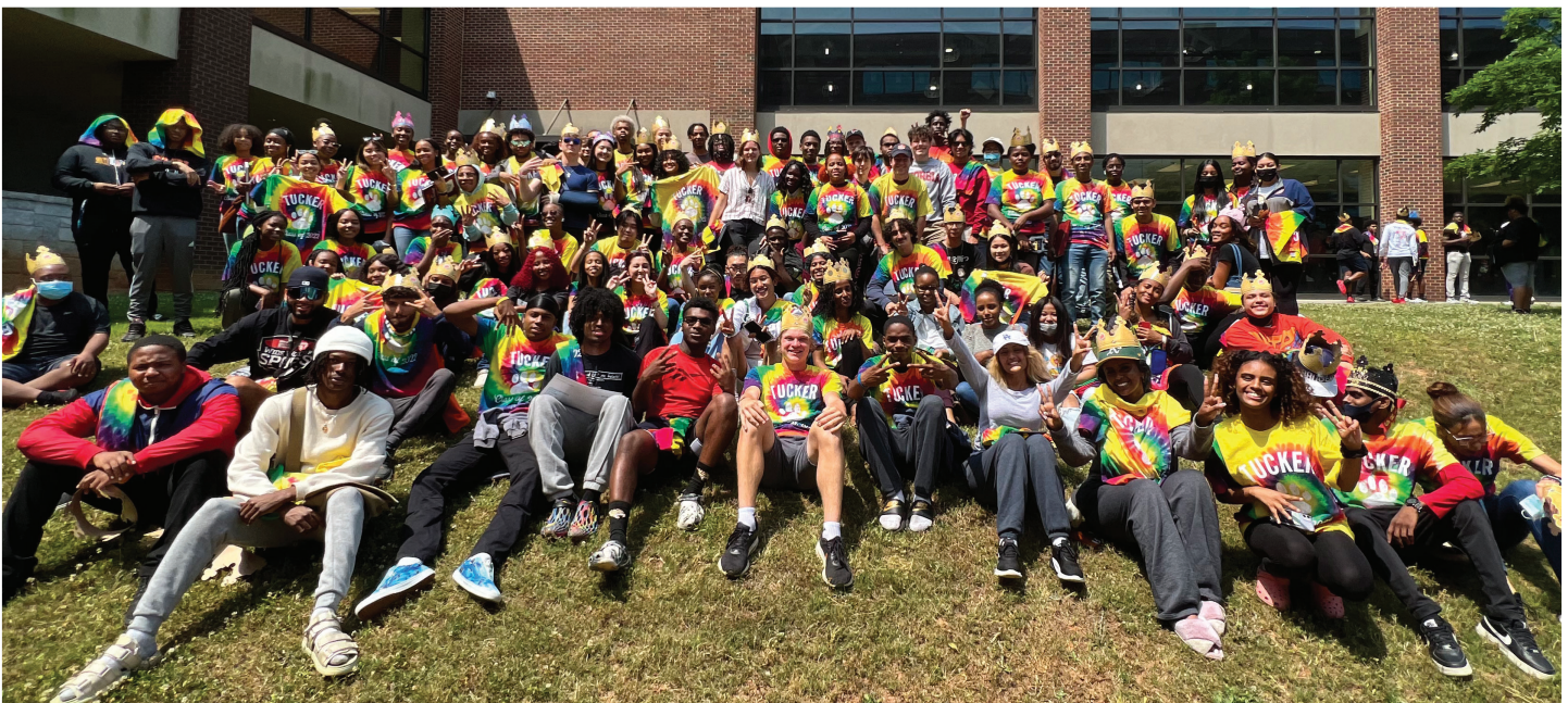
Tucker High School had 329 graduates and they are attending colleges and universities all across the nation, including Emory, KSU, UGA, Georgia Tech and Yale.