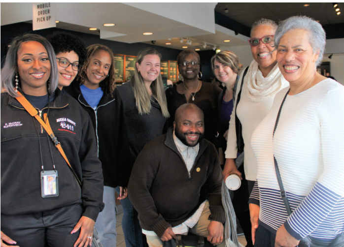
NOTE: Pictures were taken pre-pandemic so the DKPD mask policy was not in place.

DeKalb has been successfully hosting these events throughout our territory since mid-2014. On Tuesday April 26 we hosted our first Coffee with a Cop since March 2020! We are glad to be back! So please join your neighbors and our police officers for conversation over a cup of coffee. You can follow us on Nextdoor, Ring Neighbors and the DeKalb County Police Facebook page for more information on our next Coffee with a Cop event.