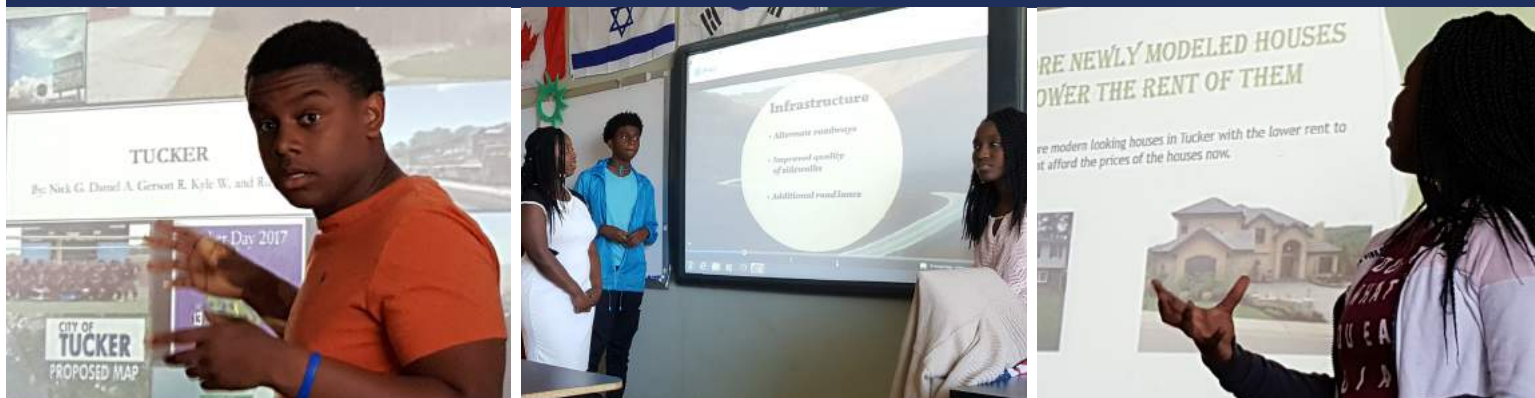
Students in Ms. Xiques' ninth-grade Government class made PowerPoint presentations on a 10 year plan for the City of Tucker. The projects were done in conjunction with the 'Tucker Tomorrow' Comprehensive Plan process at Tucker High School.