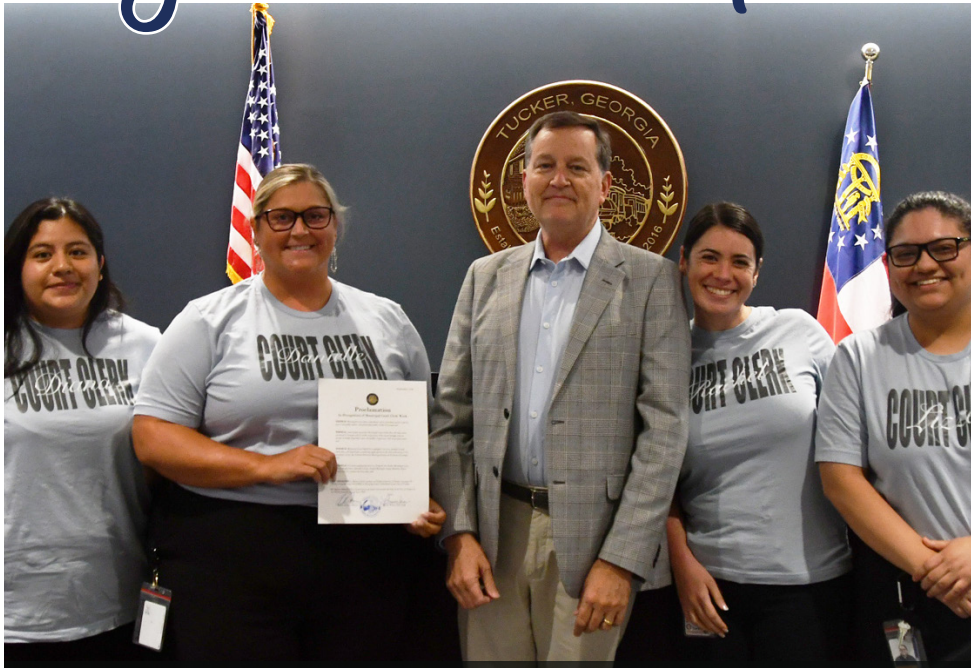
Municipal Clerk Week was celebrated with a proclamation and matching t-shirts.

May and June saw a lot of budget talks for the City of Tucker and the Mayor and Council. The process starts internally in February of each year, and the City Manager presents a balanced budget starting in May for public comment and direction from the Mayor and Council, with final approval in June. The approved FY25 budget can be found on the City website at tuckerga.gov/finance .