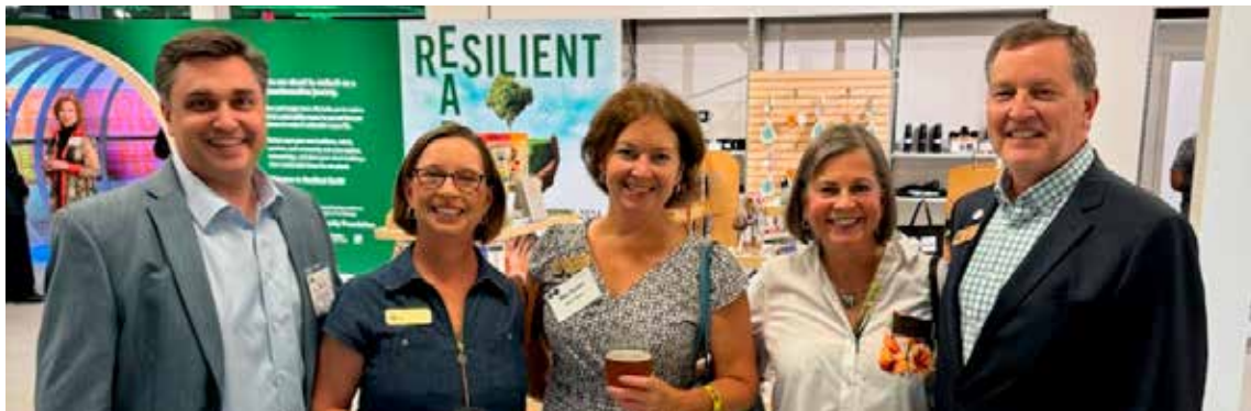
Visit the Science Gallery at Emory's exhibit "Resilient Earth" at Northlake. It is free to the public through April 2025

The Tucker Mayor and City Council meet on the second and fourth Mondays of each month at Tucker City Hall, 1975 Lakeside Parkway, Suite 350B, Tucker, GA 30084 and are streamed and recorded on tuckerga.gov